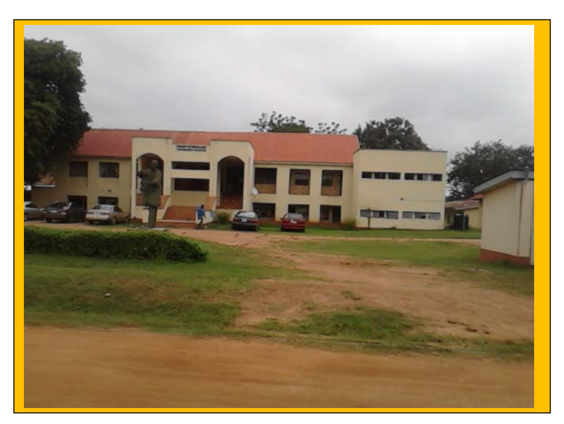
FACULTY OF SOCIAL & MANAGEMENT SCIENCES BLOCK