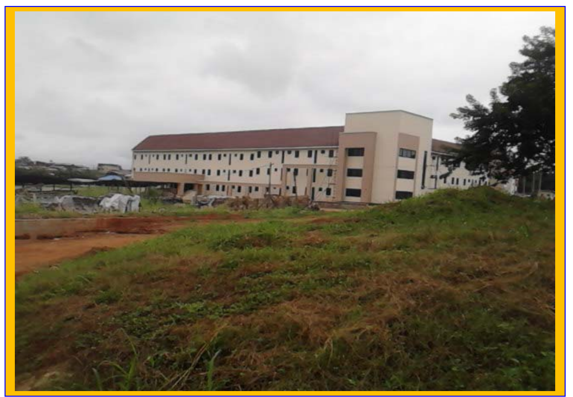
UNIVERSITY FEMALE HALL