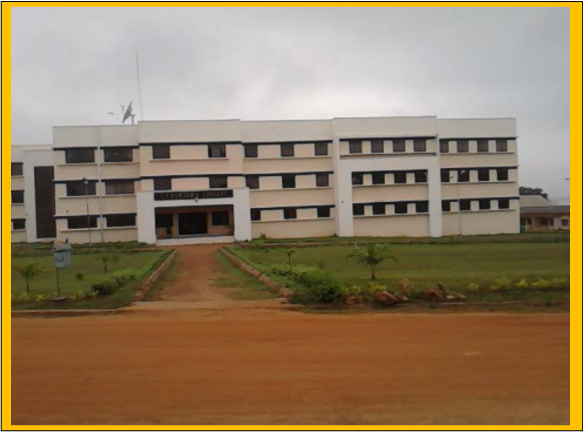
D Y T DANJUMA LIBRARY