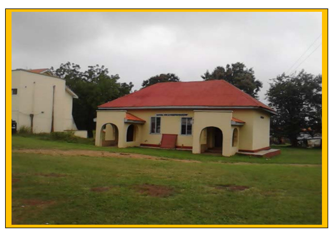
CENTRE FOR ENTREPRENEURSHIP STUDIES